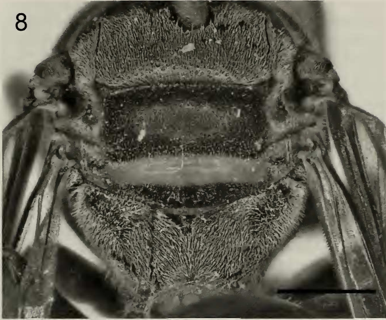
Figs 1–8. Continued.

scutellum with fine, dense punctation and covered with straight hairs. Mesepisternum with scrobal furrow beginning at margin beneath tegula and curving posteriorly to form a gentle arc about half as long as the mesepisternum, which is rounded anterior to the furrow. Dorsal pronotal carina well developed, ending close to the posterior margin. Pronotal